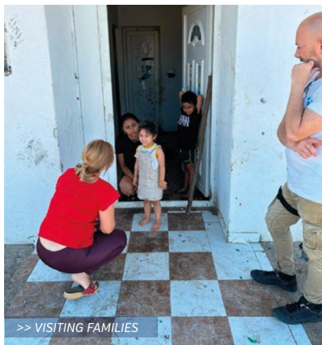
>> VISITING FAMILIES